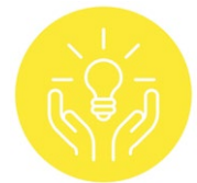
A prosperous Wales

These actions will satisfy the following 2009 Measure Improvement Objectives;