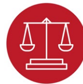
A more equal Wales